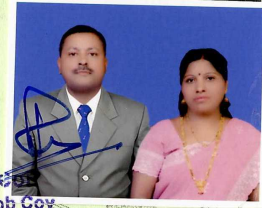
Maj/Lt Col OC Demob Coy Depot Regt (Corps of Signals)