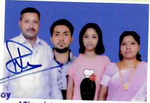
Maj/Lt Col OC Demob Coy Depot Regt (Corps of Signals)