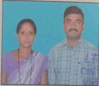
54 Joint Photograph of pensioner with wife