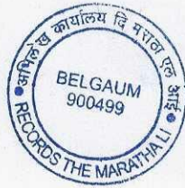
Lt Col Senior Record Officer for OIC Records