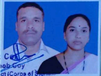
Maj/Lt Col OC Demol Coy Depot Regt (Corps of Signals)