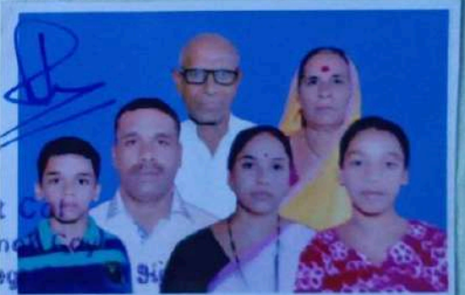
Maj/Lt Col OC Demol Coy Depot Regt (Corps of Signals)