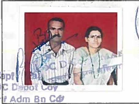
Capt OC Depot Coy of Adm Bn C

(a) Joint photograph of pensioner and wife.