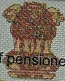
55 Joint Photograph of pensioner with all dependents.