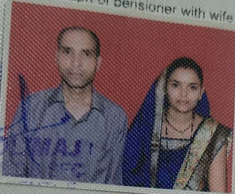
54 Joint Photograph of pensioner with wife