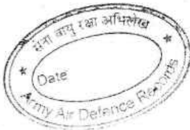
Maj RO for OIC Records