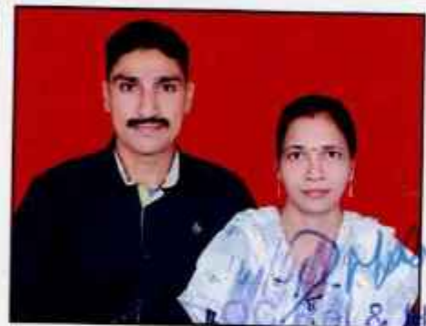
OC Rel & Hold Coy EME Depot Bn