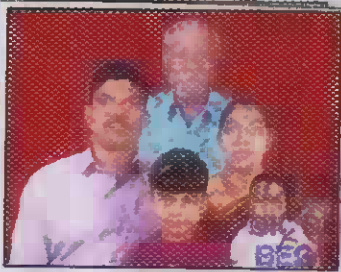
55 Joint Photograph of pensioner with all dependents.