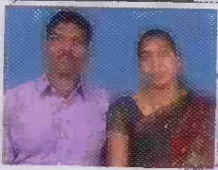
54 Joint Photograph of pensioner with wife