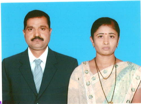
Maj OC Depot Coy The MARATHA LIRC

(a) Joint photograph of pensioner and wife.