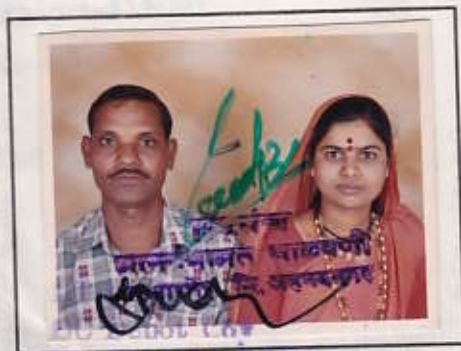
The Maratha LIRO

(a) Joint photograph of pensioner and wife.