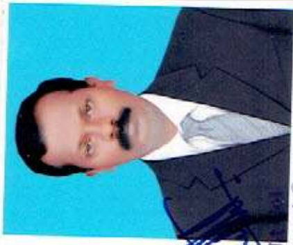
COY OC Depot Coy The MARATHA LIRC