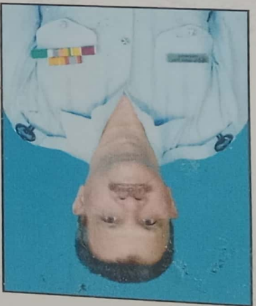
Passport Size Photograph