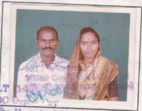
LT OC Depot Coy The Maratha LIRC

(a) Joint photograph of pensioner and wife.