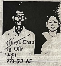
Joint Photograph of Airman