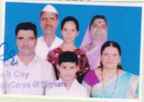
Maj/Lt Col OC Demob Coy Depot Regt (Corps of Signals)

55. Joint Photograph of pensioner with all dependents.