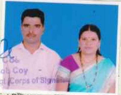
Maj/Lt Col OC Demob Coy Depot Regt (Corps of Signals)

54. Joint Photograph of pensioner with wife/NOK.