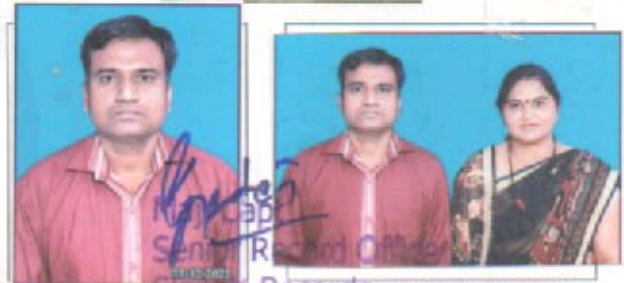
SINGLE PHOTO'S RECORDS PHOTO WITH NOK