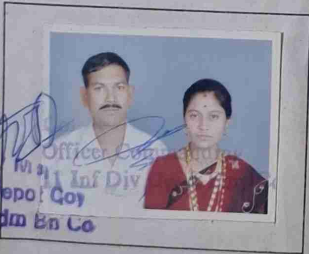
Officer Capt Capt Maj 11 Inf Div OC Depot Coy for Adm Bn Co

(a) Joint photograph of pensioner and wife.