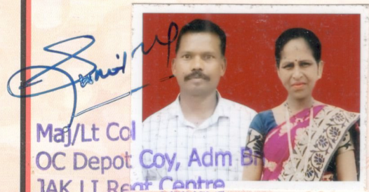
Maj/Lt Col OC Depot Coy, Adm Bn JAK LI Regt Centre