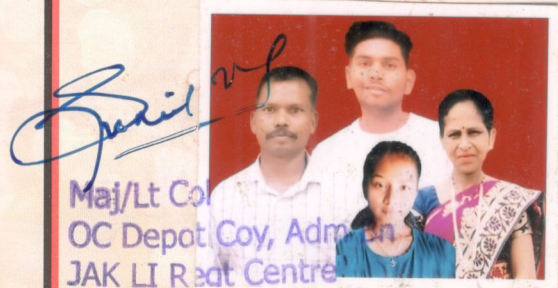
Maj/Lt Col OC Depot Coy, Adm Bn JAK LI Regt Centre