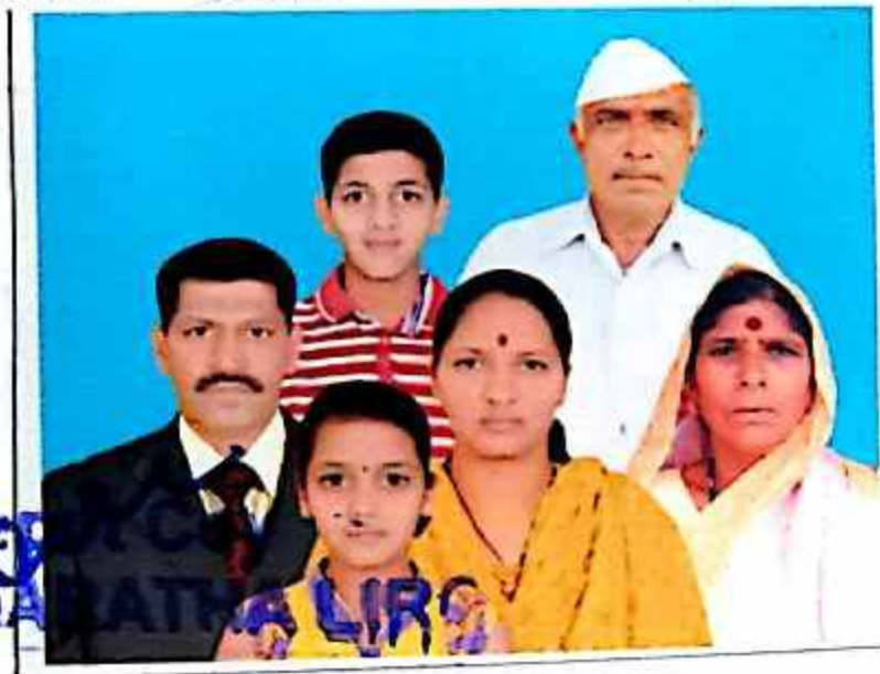
55. Joint Photograph of pensioner with all dependents.