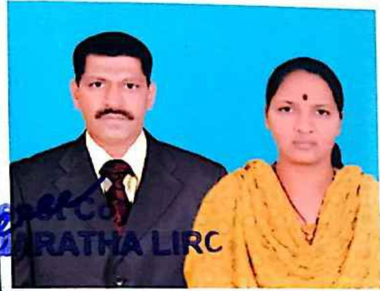
54. Joint Photograph of pensioner with wife.