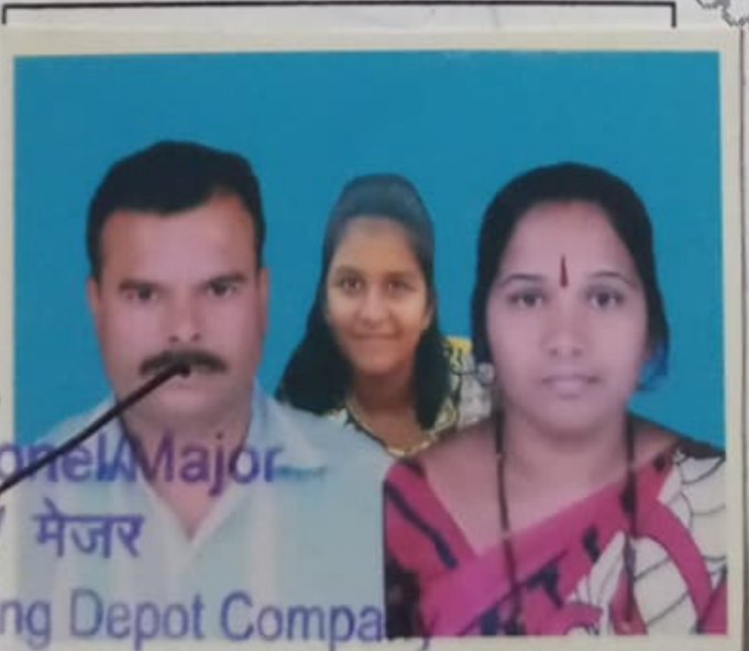
Lieutenant Colonel/Major लेफि्टनेट कर्नल / मेजर Officer Commanding Depot Company अधिकारी कमान भंडारण समूह 1 Army Service Corp Training Centre 1 सेना सेवा कोर प्रशिक्षण केंद्र