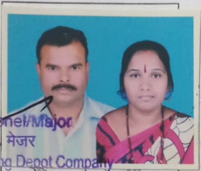
Lieutenant Colonel/Major लेफि्टनेट कर्नल / मेजर Officer Commanding Depot Company अधिकारी कमान भंडारण समूह 1 Army Service Corp Training Centre 1 सेना सेवा कोर प्रशिक्षण केंद्र