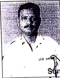
Sgt Ldr Adjutant 5 BRD, AF