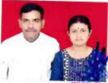
OC Ret & Hold Coy EME Depot Bn

54. Joint Photograph of pensioner with wife