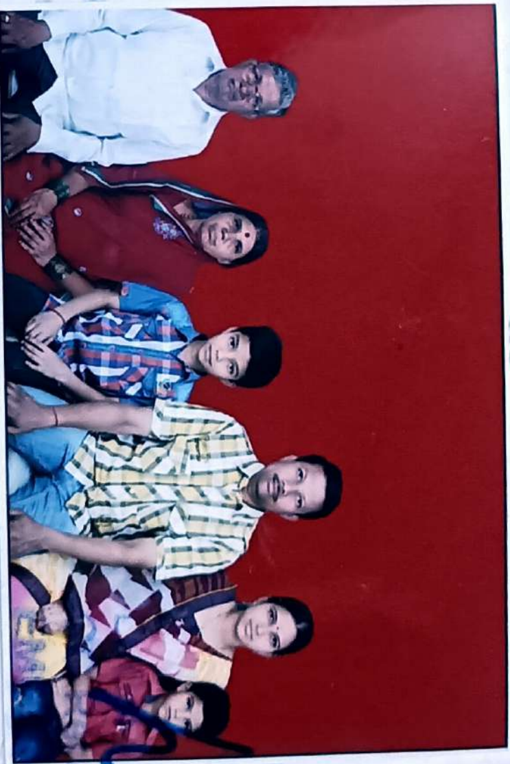
55. Joint Photograph of Pensioner with all dependents.