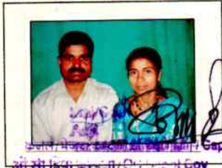
ऑ सी डिपो कंपनी / OC Depot Coy दि मराठा एल आई आर सी / The MARATHA LIRC

(a) Joint photograph of pensioner and wife.