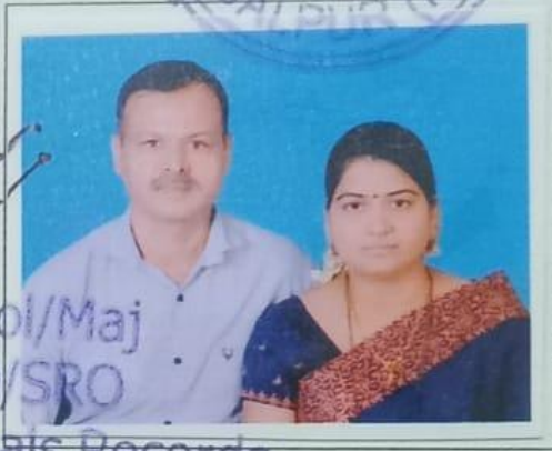
JOINT PHOTO WITH NOK