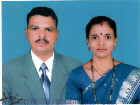
[Signature] ओ सी डिपो कंपनी / OC Depot Coy विमराठा एल आई आर सी / The MARATHA LIRC

(a) Joint photograph of pensioner and wife.