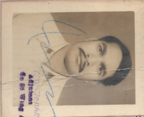
Adjutant 208 Wing