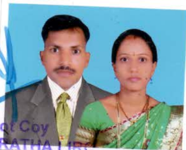
Maj OC Depot Coy The MARATHA LIR

54. Joint Photograph of pensioner with wife.