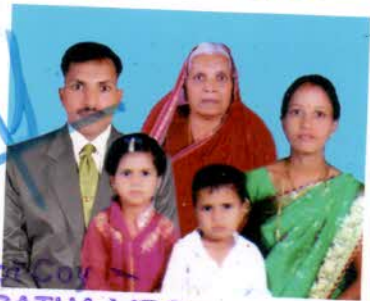
Maj OC Depot Coy The MARATHA LIR

55. Joint Photograph of pensioner with all dependents.