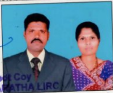
Maj OC Depot Coy The MARATHA LIRC

54. Joint Photograph of pensioner with wife.