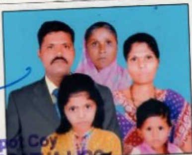
Maj OC Depot Coy The MARATHA LIRC

55. Joint Photograph of pensioner with all dependents.