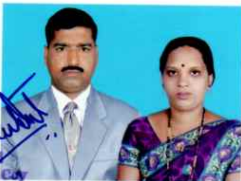
Col/Lt Col OC Depot Coy The MARATHA LIRC

(a) Joint photograph of pensioner and wife.