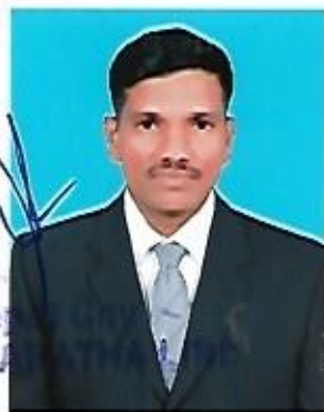
Maj OC Det The MA