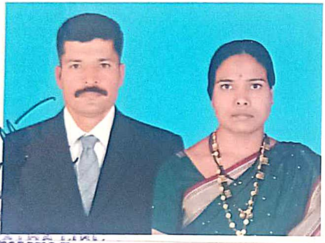
Col/Lt Col OC Depot Coy The MARATHA LIRC

(a) Joint photograph of pensioner and wife.