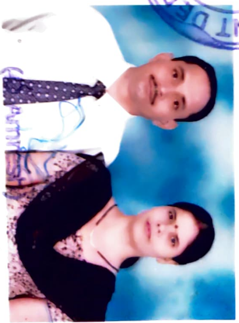
Joint Photograph of Airman

Wing Commander Commanding Officer 46 ED, Air Force