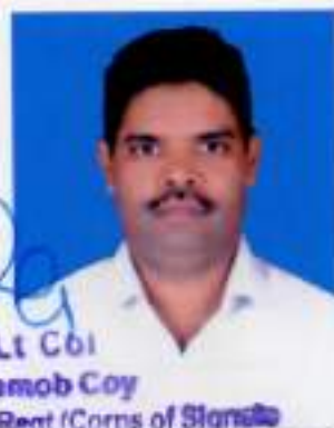
[Handwritten Signature] Maj/Lt Col OC Demob Coy Depot Reet (Corps of Signals)