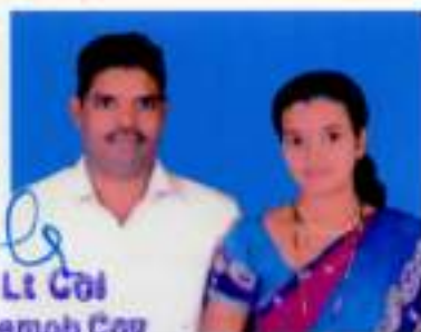
[Signature] Maj/Lt Col OC Demob Coy Depot Regt (Corps of Signals)