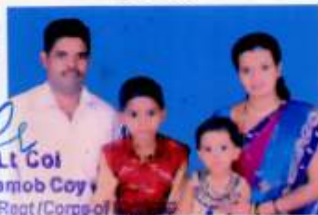
[Signature] Maj/Lt Col OC Demob Coy Depot Regt (Corps of Signals)