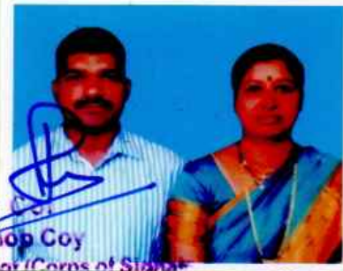
Maj/Lt Col OC Demob Coy Depot Regt (Corps of Signal)