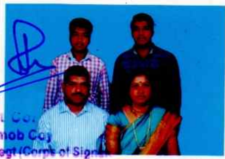
Maj/Lt Col OC Demob Coy Depot Regt (Corps of Signal)