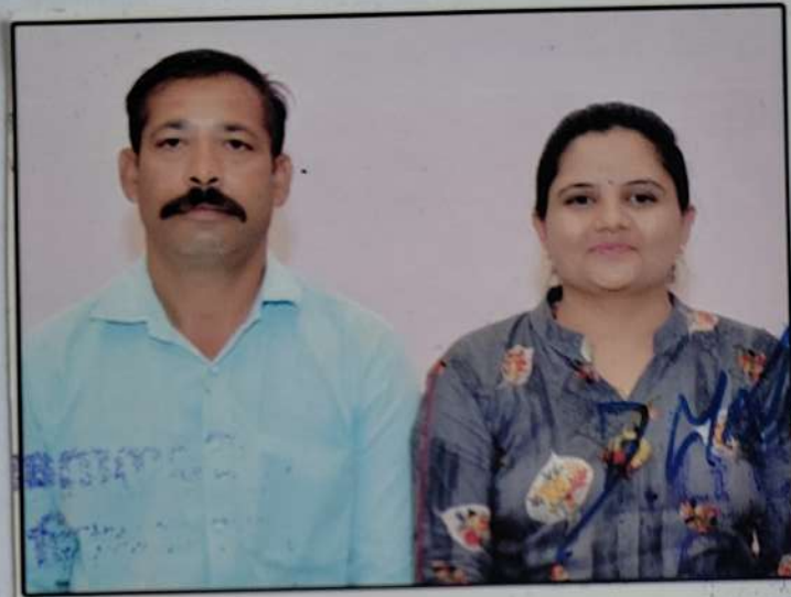
54. Joint Photograph of pensioner with wife

[Handwritten signature] Rel & Hold Coy EME Depot Bn