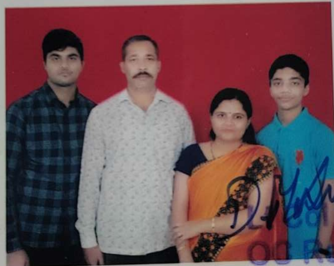
55. Joint Photograph of pensioner with all dependents.

[Handwritten signature] Rel & Hold Coy EME Depot Bn