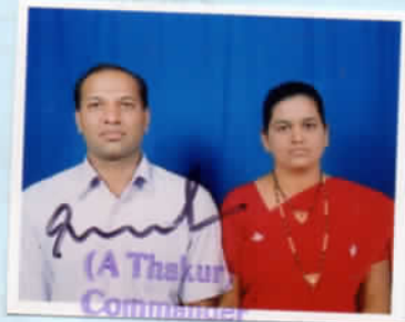
Officer-in-Charge Release Centre

Identity Certificate for the families of Service pensioner should include Joint Photograph of pensioner and wife/NOK