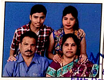
& Hold Coy EME Depot BN

55. Joint Photograph of pensioner with all dependents.