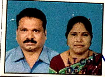
Hold Coy EME Depot BN

54. Joint Photograph of pensioner with wife