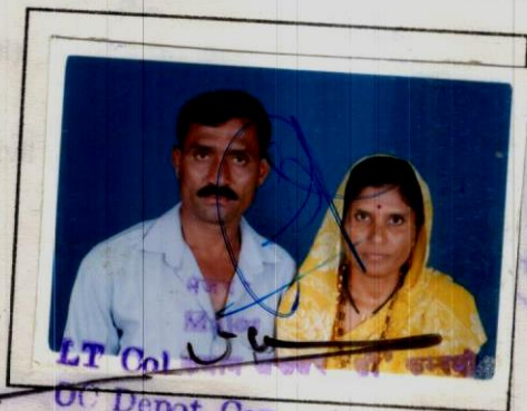
LT Col OC Depot Coy The Maratha LIR