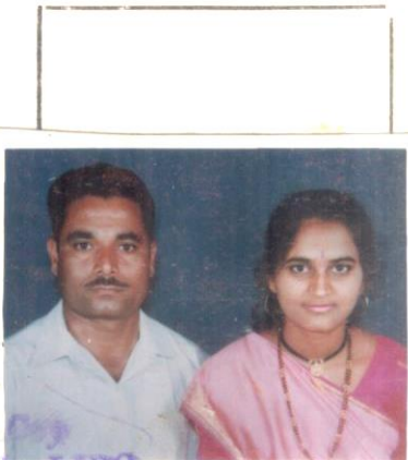
LT Col OC Depot The Maratha LIRO

(a) Joint photograph of pensioner and wife.